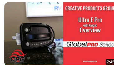
Ultra E Pro Lock with Keypad Overview

Instructional videos can be found on Creative Products Group YouTube Channel.