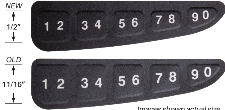
Images shown actual size